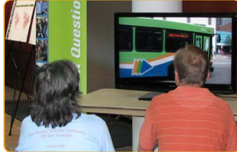
Left: Participants at the Cary workshop look at a video on the Triangle's need for better transit. Right: Younger participants, like these in Durham, had a chance to learn about transit at the workshops.

The study will survey existing transportation-related conditions,