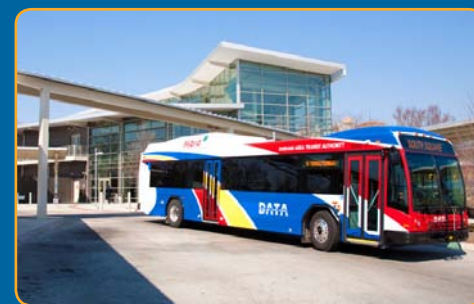
Beginning, October 1, Triangle Transit will assist the City of Durham in operating DATA.