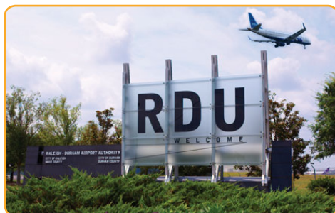
Triangle Transit will begin direct service from Downtown Raleigh to the RDU Airport in August.