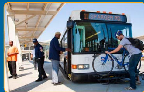
While Triangle Transit will help operate DATA, it will remain a separate transit service.

Triangle Transit also will assist in managing the new fare-free downtown circulator called the Bull City Connector. The connector bus service, starting August 16, will link Duke Clinics on West Campus with Downtown Durham between 7 a.m. and midnight Monday through Saturday. Six new hybrid/diesel buses will be used on the route.