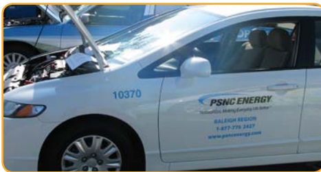
Natural Gas and Hybrid Cars were on display during the Smart Commute Challenge

For those wanting to learn more about alternative commute opportunities, sponsored by GoTriangle.org and SmartCommute@RTP, go to www.smartcommutechallenge.org .