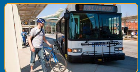
The rider survey and route recommendations should be completed by mid 2012.