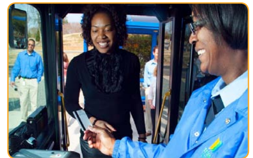
Triangle Transit is seeing record ridership in 2011 because of fuel prices

Fuel prices, better weather and the Smart Commute Challenge have helped ridership along with Wi-Fi and trip planning using Google Transit.