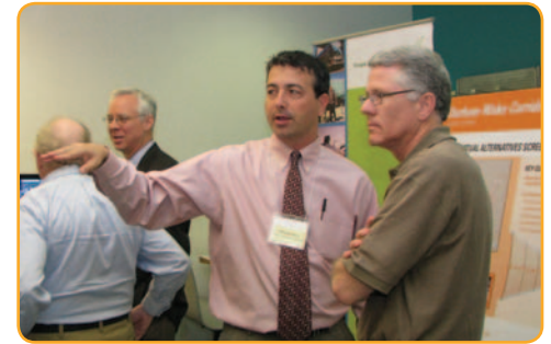
Over 1,100 people attended sessions in the three counties to help determine future bus/rail transit options

The final draft of bus and rail options come after 24 public workshops by Triangle Transit and the region's two metropolitan planning organizations. Nineteen workshops