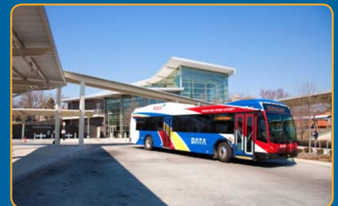
Triangle Transit began management of DATA in October 2010.

Results from the on-board survey, personal interviews, neighborhood, corporate and government meetings will be used to make recommendations to Durham's City Council on changes to DATA's route system in Fiscal Year 2012-2013.