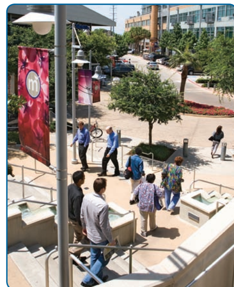
Mockingbird Square in Dallas is a prime example of transit development with adjacent bus and rail lines.

A well-planned, high quality transportation network will bring together the great communities that make up the Triangle, connecting people and places across the region with safe, reliable and easy-to-use transportation options.