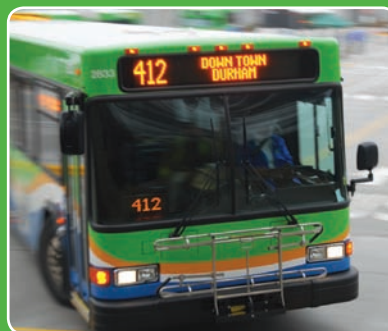
Newer buses are on the way with help from the President's Stimulus Package.

In the President's State of the Union speech on February 24, Mr. Obama cited public transportation among top priorities in his administration. In the