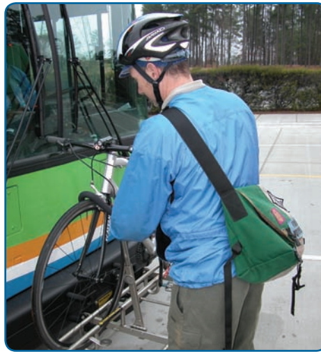
More commuters are biking for part of their work trip.