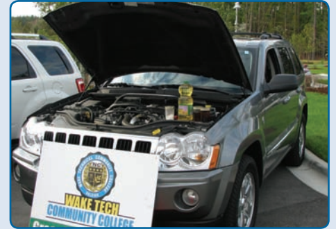
The Smart Commute Challenge has a new category this year for participants who use an alternate fuel vehicle like this Jeep that runs on cooking oil.