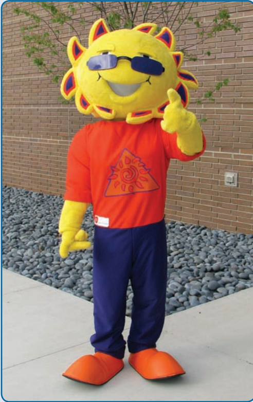
CAM the "Clean Air Maniac" gives a thumbs up to this year's Smart Commute Challenge