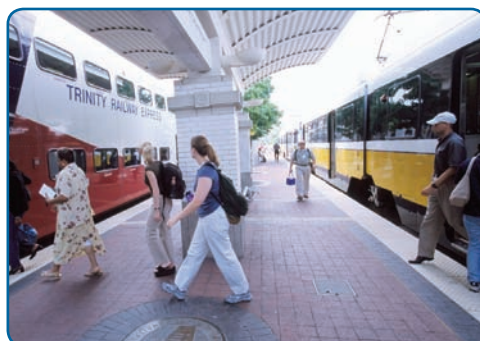
Dallas-Fort Worth, under study by Triangle leaders, has a mix of commuter rail and light rail service.

Consistently in Money Magazine's "Best Places to Live," Cary will have commuting options to Durham, RTP,