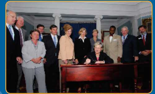
Governor Bev Perdue signs the Intermodal Bill into law—a huge step toward improving transit in North Carolina.