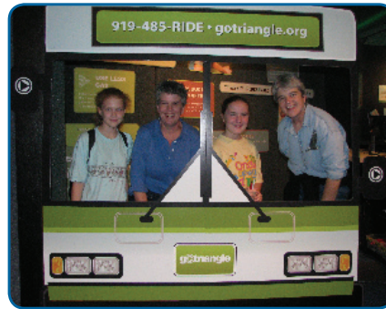
This year's exhibit co-sponsored by Triangle Transit and GoTriangle.org let people smile for the camera in a bus mockup at the site

Triangle Transit provided thousands of people headed to the N.C. State Fair with an alternative to driving and parking. Shuttle service was provided on both weekends of the fair, with pickups at the Eubanks Road Park-and-Ride in Chapel Hill and the Regional Transit Center on Slater Road in Durham, near the Research Triangle Park.