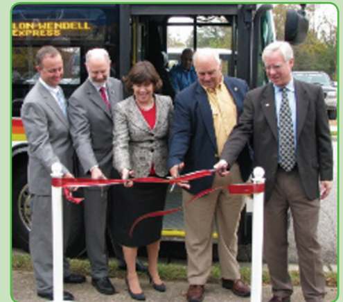
Local and Wake Med officials dedicate the new Zebulon-Wendell-Raleigh express

The service is a partnership of Triangle Transit, the Towns of Wendell and Zebulon, and the City of Raleigh. The ZWX Express is part of Triangle Transit's Short Range Transit Plan to improve transit connections in the region. This marks the second partnership with Capital Area Transit to provided the service by agreement with Triangle Transit. Service between Wake Forest and Raleigh began last summer.