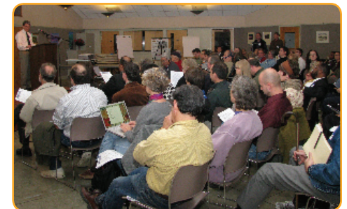
Durham Orange Friends of Transit (DO Transit) holds its organizational meeting in early November 2009

The plans, drawn from Long Range Transportation Plans adopted by the Capital Area MPO and the Durham-Chapel Hill-Carrboro MPO, will begin to determine the level of expanded bus service and light rail service that may be possible