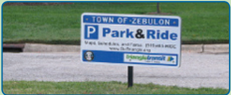
Both Zebulon and Wendell will have shelters and park and ride lots.